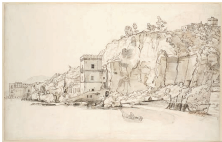
View of the Bay of Posillipo , by Claude-Joseph Vernet (1714–1789). Inscribed in pen and brown ink: 'vue de poussilpo'. Pen and grey ink and grey wash over black chalk on two joined sheets of paper, 45 by 70.7 cm. KATRIN BELLINGER, MUNICH