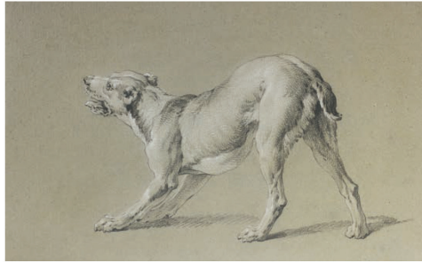
Study of a dog, by Jean-Baptiste Oudry (1686-1755). Black chalk with white chalk highlights on blue paper, 23.3 by 35.2 cm.

A selection of highlights to be exhibited at the Fair