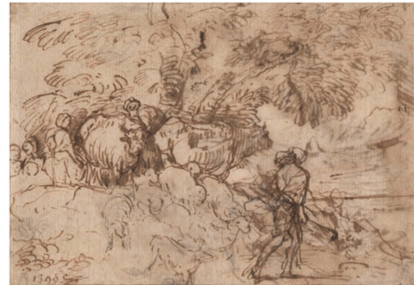
Landscape with herds (verso: study of a tree) , by Giovanni Benedetto Castiglione called Il Grechetto (1609-64). Pen and brown ink, over black chalk, 10.5 by 15.4 cm.