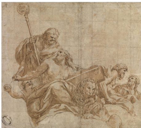
St Augustine, St Jerome (possibly St Mark), St Bartholomew and an unidentified saint, by Ciro Ferri (1634–89). Quill and brown wash on black chalk, 38 by 43.4 cm.

A LITTLE LATER than in previous years, the twenty-second Salon du Dessin will be staged during the second week of April. Once more, the fair will occupy the architectural splendour of the Palais Brongniart where thirty-nine notable drawings dealers will sell works ranging from old masters to modern and contemporary. This dealer-led event has also been the catalyst behind the ever-strengthening Semaine du Dessin, a concurrent programme of museum exhibitions and events. A loan exhibition, symposium of lectures and the Contemporary Drawing Prize (all staged at the Palais Brongniart) will add to a heady mix of temptations for aficionados of drawings.