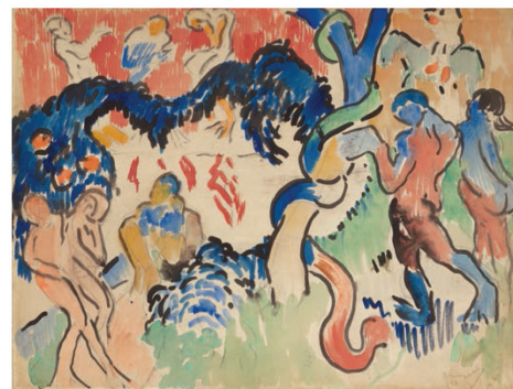
The earthly paradise, by André Derain (1880-1954). Signed at bottom right: 'A. Derain'. Watercolour, 50 by 65 cm.