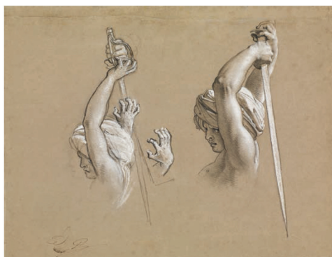
Studies of young oriental with sword for the 'Revolt of Cain', by Anne Louis Girodet de Roucy- Trioson (1767-1824). Pencil, stump, white chalk highlights, 28.4 by 36.8 cm.